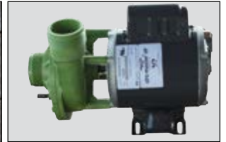
BlueTooth Docking Station Circulation Pump