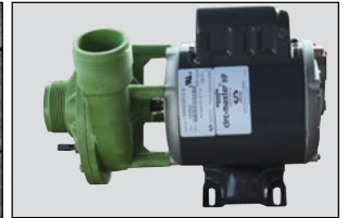
BlueTooth Docking Station Circulation Pump