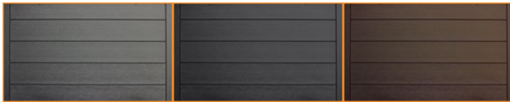
Gray Black Espresso