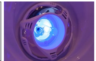
Illuminated Jets / White Palm