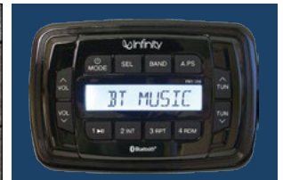
Infinity™ Audio System