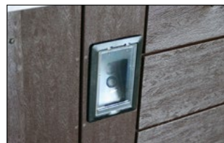
BlueTooth Docking Station